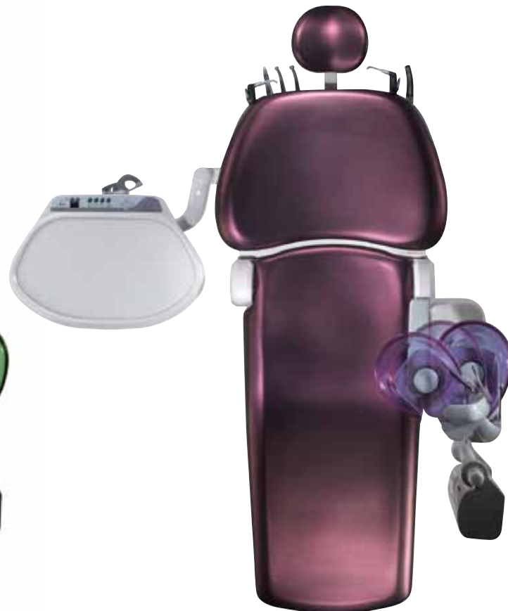
Spaceline EMCIA SMT