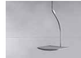
Ceiling-mounted additional tray