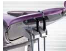
Flexible assistant's element with 3 instruments and operator panel

Multi-functional syringe, optional with LED light Suction tube (spray mist ejector) Saliva ejector