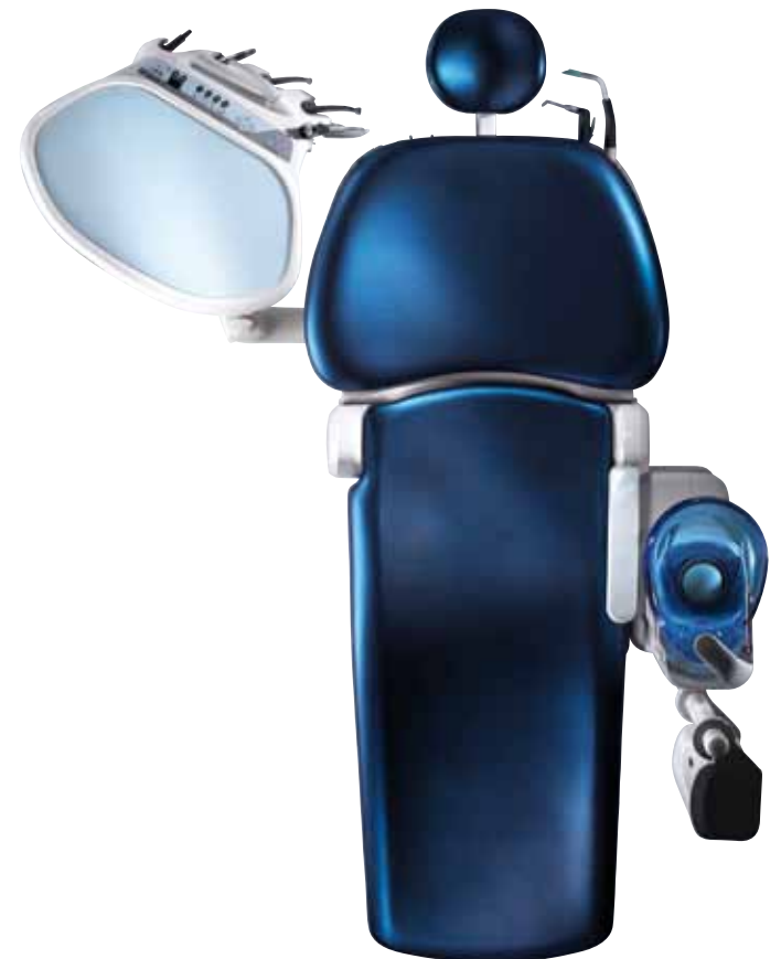
Spaceline EMCIA PdW