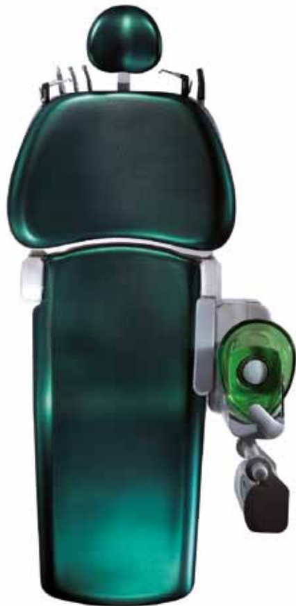
Spaceline EMCIA for orthodontists