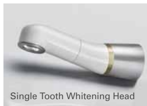
Single Tooth Whitening Head

Free from the memory effect, charging the battery with a partial charge will not affect the life of the battery.